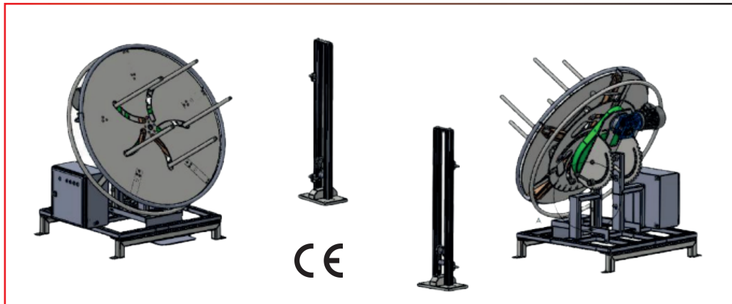
FIXATION SUPPORT OPTION

Particularly adapted for coiling flexibles hoses